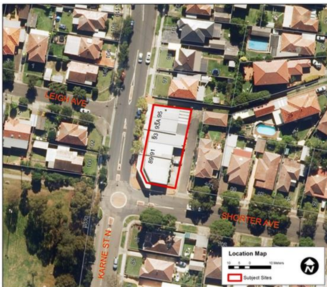
Map 1: Location

The site is serviced by a number of local bus networks within 400m walking distance. The site is situated approximately 1.3km (walking distance by foot/road) from Narwee Railway Station and the Narwee town centre.