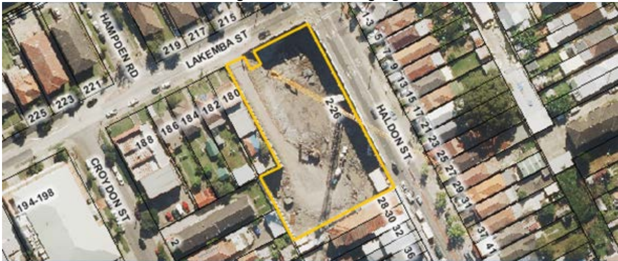
FIGURE 1: Photo showing 2-26 Haldon Street Lakemba with the small portion of public road fronting Lakemba Street highlighted

More recently, the owners are in the process of completing their development. In doing so, they are required to formally acquire the road reserve.