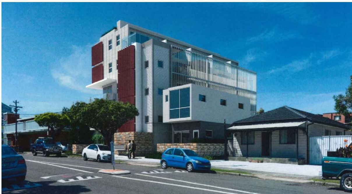
Figure 3: Architect's impression of the proposed development, as amended.