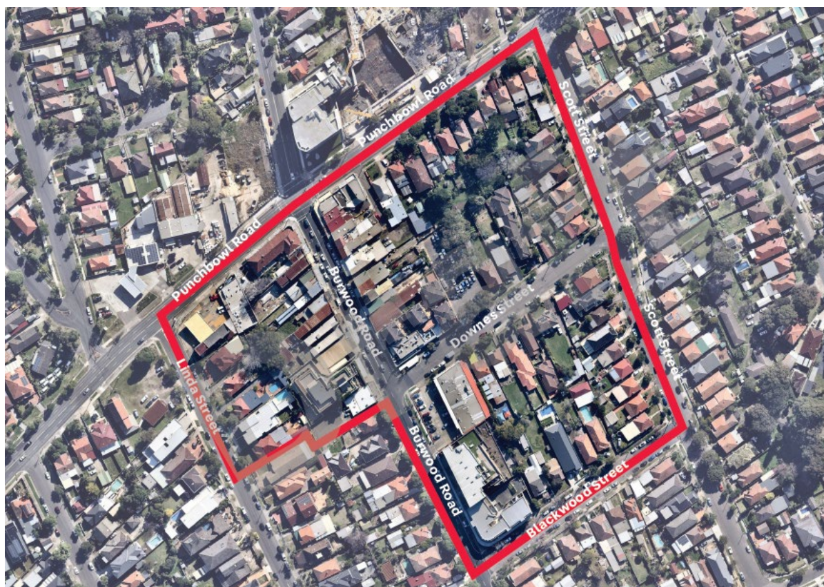
Figure 1. Belfield Small Village Centre

The centre provides a mix of convenience retail, local dining and other services and amenities, however lacks the provision of quality public or civic space. A master plan for this centre would allow the assessment of its role in terms of its retail and services, and identification of opportunities to enhance the centre's business and housing offering to create a more dynamic and liveable place.